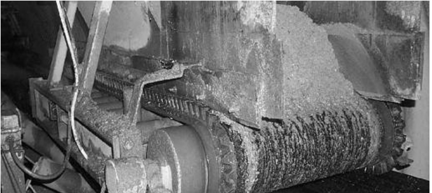
Sea-dredged aggregates working in wet, salty and aggressive environment! IP66/67 sealing – a MUST – often with re-greasable seals!